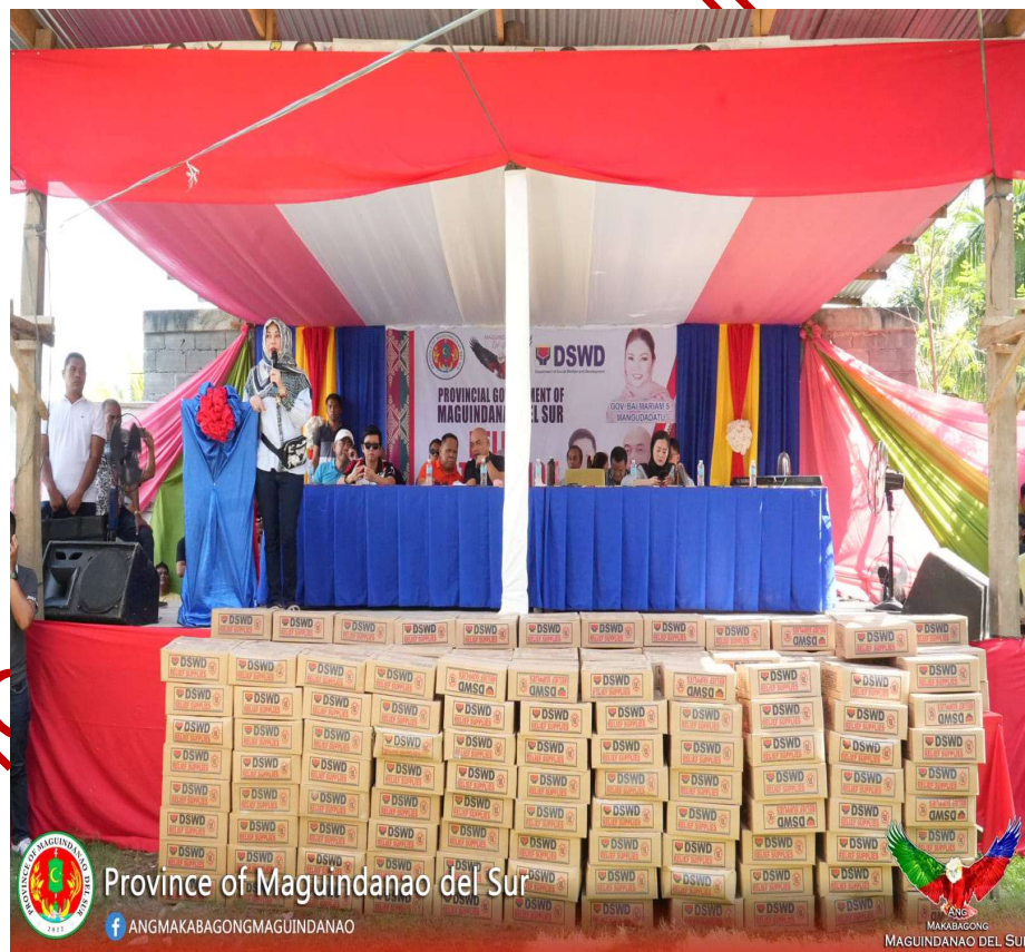
Disaster Relief Operation at the Municipality of Pagalungan, Maguindanao del Sur