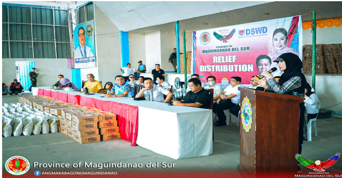
Disaster Relief Operation at the Municipality of Datu Saudi, Datu Montawal and Datu Unsay Maguindanao del Sur