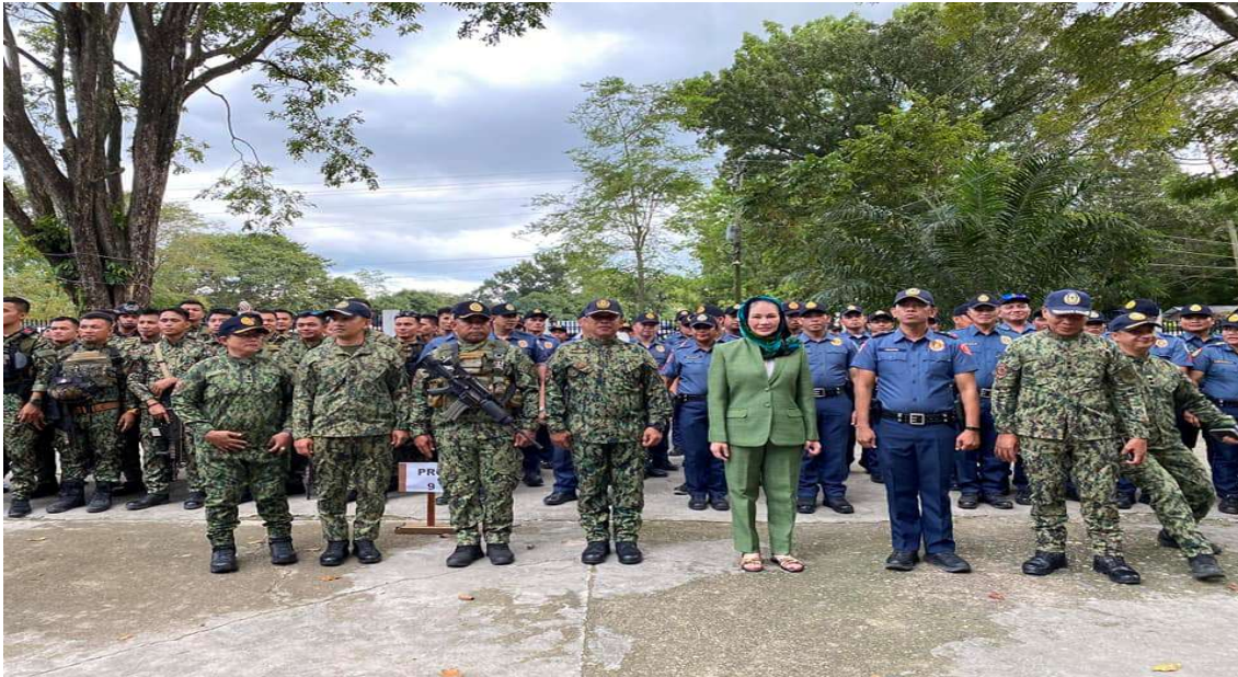
Send off Ceremony of the members of PNP who serve as Board of election inspector in the Province of Maguindanao del Sur