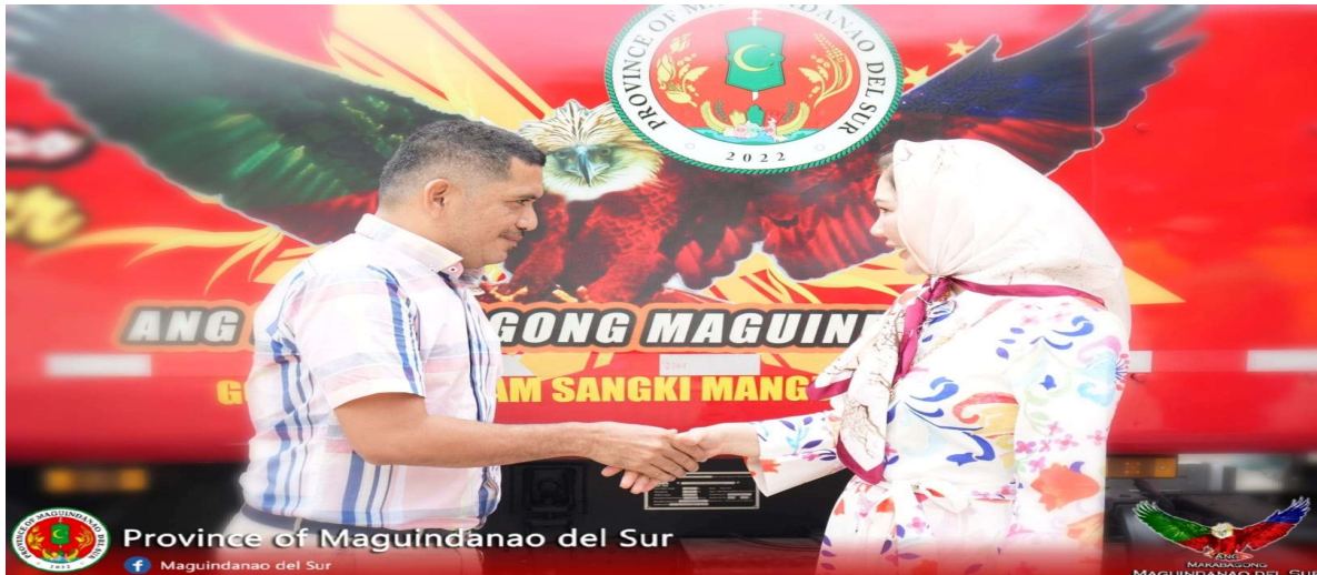
Hon. Bai Mariam S. Mangudadatu led the turnover of Garbage truck and simultaneous signing of Usufruct agreement to the different Municipalities of Maguindanao del Sur