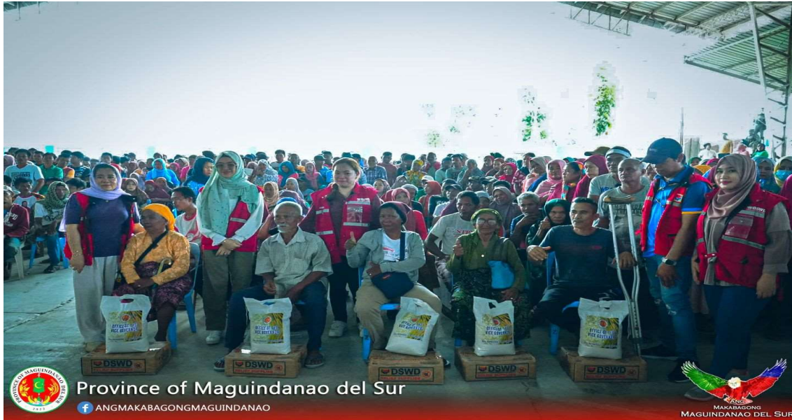
Disaster Relief Operation at the Municipality of Datu Saudi, Datu Montawal and Datu Unsay Maguindanao del Sur