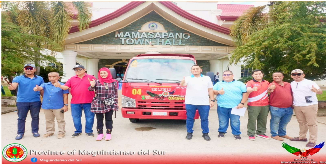
Hon. Bai Mariam S. Mangudadatu led the turnover of Garbage truck and simultaneous signing of Usufruct agreement to the different Municipalities of Maguindanao del Sur